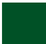
Forest Green Traditional

The official colors for Pennfield Schools are listed below for use in the contest. Forest Green and White are the primary colors for the District, whereas Black, Silver, and Dartmouth Green are accent colors.